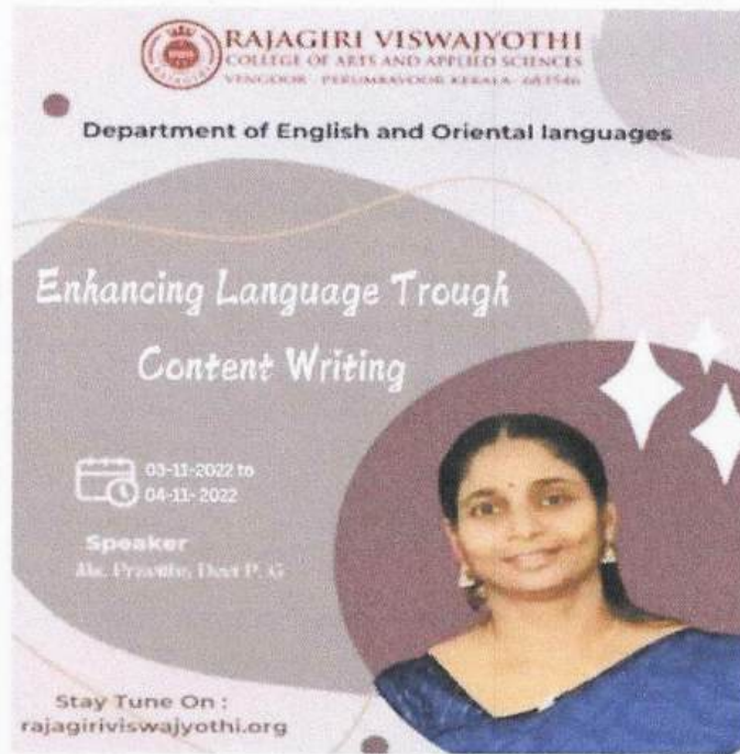
Poster of the Workshop on Enhancing Language Skills through Content Writing