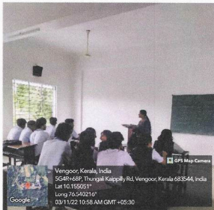
Photo of the Workshop on Enhancing Language Skills through Content Writing